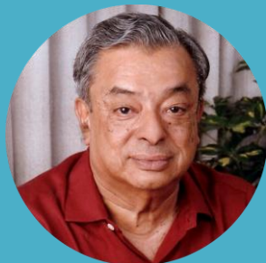
Dr. Verghese Kurien

A quarterly magazine of Anandalaya, April 2019 - June 2019 : Issue - 8